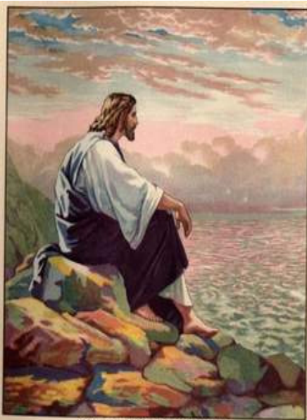
GENTLE JESUS, MEEK AND MILD

FILLED WITH THE HOLY SPIRIT, JESUS LEFT THE JORDAN AND WAS LED BY THE SPIRIT THROUGH THE WILDERNESS, BEING TEMPTED THERE BY THE DEVIL FOR FORTY DAYS. DURING THAT TIME HE ATE NOTHING AND AT THE END HE WAS HUNGRY. THEN THE DEVIL SAID TO HIM, 'IF YOU ARE THE SON OF GOD, TELL THIS STONE TO TURN INTO A LOAF.' BUT JESUS REPLIED, 'SCRIPTURE SAYS: MAN DOES NOT LIVE ON BREAD ALONE.' THEN LEADING HIM TO A HEIGHT, THE DEVIL SHOWED HIM IN A MOMENT OF TIME ALL THE KINGDOMS OF THE WORLD AND SAID TO HIM, 'I WILL GIVE YOU ALL THIS POWER AND THE GLORY OF THESE KINGDOMS, FOR IT HAS BEEN COMMITTED TO ME AND I GIVE IT TO ANYONE I CHOOSE. WORSHIP ME THEN, AND IT SHALL ALL BE YOURS.' BUT JESUS ANSWERED HIM, 'SCRIPTURE SAYS: YOU MUST WORSHIP THE LORD YOUR GOD AND SERVE HIM ALONE.' THEN HE LED HIM TO JERUSALEM AND MADE HIM STAND ON THE PARAPET OF THE TEMPLE. 'IF YOU ARE THE SON OF GOD', HE SAID TO HIM 'THROW YOURSELF DOWN FROM HERE, FOR SCRIPTURE SAYS: HE WILL PUT HIS ANGELS IN CHARGE OF YOU TO GUARD YOU, AND AGAIN: THEY WILL HOLD YOU UP ON THEIR HANDS IN CASE YOU HURT YOUR FOOT AGAINST A STONE'. BUT JESUS ANSWERED HIM, 'IT HAS BEEN SAID: YOU MUST NOT PUT THE LORD YOUR GOD TO THE TEST.' HAVING EXHAUSTED ALL THESE WAYS OF TEMPTING HIM, THE DEVIL LEFT HIM, TO RETURN AT THE APPOINTED TIME.