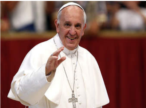
Prayer by Pope Francis to celebrate Vocations Sunday 2016

VOCATIONS ARE BORN WITHIN THE CHURCH : VOCATIONS GROW WITHIN THE CHURCH VOCATIONS ARE SUSTAINED BY THE CHURCH