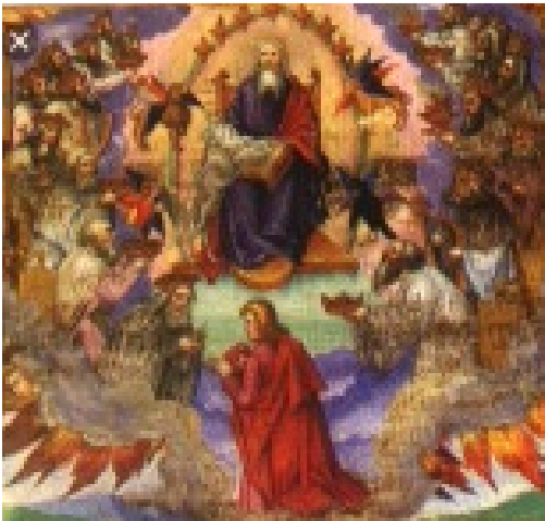
A PAINTING IN WORDS FROM THE BOOK OF THE APOCALYPSE

I, JOHN, SAW A NEW HEAVEN AND A NEW EARTH; THE FIRST HEAVEN AND THE FIRST EARTH HAD DISAPPEARED NOW, AND THERE WAS NO LONGER ANY SEA. I SAW THE HOLY CITY AND THE NEW JERUSALEM, COMING DOWN FROM GOD OUT OF HEAVEN, AS BEAUTIFUL AS A BRIDE ALL DRESSED FOR HER HUSBAND. THEN I HEARD A LOUD VOICE CALL FROM THE THRONE, YOU SEE THIS CITY? HERE GOD LIVES AMONG MEN. HE WILL MAKE HIS HOME AMONG THEM; THEY SHALL BE HIS PEOPLE, AND HE WILL BE THEIR GOD; HIS NAME IS GOD-WITH-THEM. HE WILL WIPE AWAY ALL TEARS FROM THEIR EYES, THERE WILL BE NO MORE DEATH, AND NO MORE MOURNING OR SADNESS. THE WORLD OF THE PAST HAS GONE. 'THEN THE ONE SITTING ON THE THRONE SPOKE: 'NOW I AM MAKING THE WHOLE OF CREATION NEW.