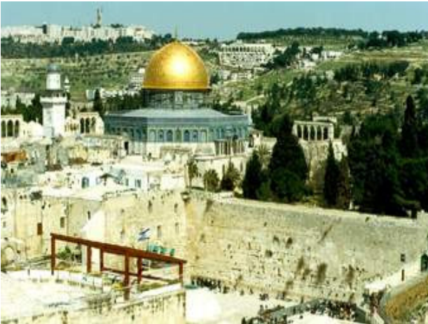
HOLY CITY OF JERUSALEM

JESUS SAID TO HIS DISCIPLES: 'IF ANYONE LOVES ME HE WILL KEEP MY WORD, AND MY FATHER WILL LOVE HIM, AND WE SHALL COME TO HIM AND MAKE OUR HOME WITH HIM .....PEACE I BEQUEAT TO YOU, MY OWN PEACE I GIVE YOU, A PEACE THE WORLD CANNOT GIVE, THIS IS MY GIFT TO YOU. DO NOT LET YOUR HEARTS BE TROUBLED OR AFRAID. YOU HEARD ME SAY: I AM GOING AWAY, AND SHALL RETURN. IF YOU LOVED ME YOU WOULD HAVE BEEN GLAD TO KNOW THAT I AM GOING TO THE FATHER, FOR THE FATHER IS GREATER THAN I. I HAVE TOLD YOU THIS NOW BEFORE IT HAPPENS, SO THAT WHEN IT DOES HAPPEN YOU MAY BELIEVE.