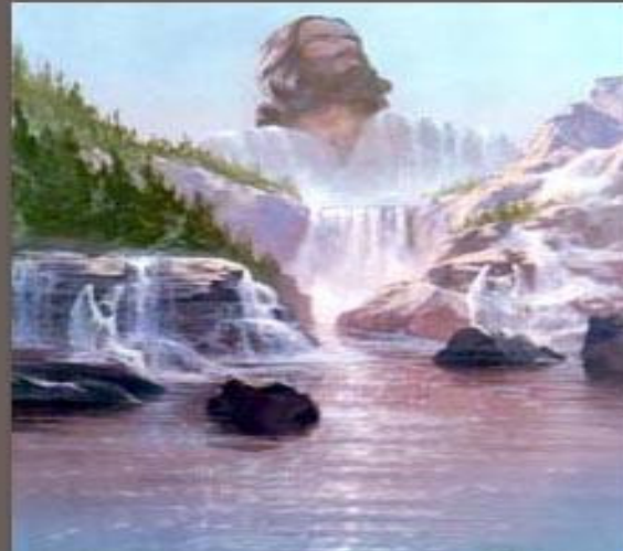
Jesus is our way our truth and our life

.....JESUS TOLD THEM THIS PARABLE BUT THEY FAILED TO UNDERSTAND WHAT HE MEANT BY TELLING IT TO THEM SO JESUS SPOKE TO THEM AGAIN: 'I TELL YOU MOST SOLEMNLY I AM THE GATE OF THE SHEEPFOLD. ALL OTHERS WHO HAVE COME ARE THIEVES AND BRIGANDS; BUT THE SHEEP TOOK NO NOTICE OF THEM. I AM THE GATE. ANYONE WHO ENTERS THROUGH ME WILL BE SAFE:: HE WILL GO FREELY IN AND OUT AND BE SURE OF FINDING PASTURE. THE THIEF COMES ONLY TO STEAL AND KILL AND DESTROY. I HAVE COME SO THAT THEY MAY HAVE LIFE AND HAVE IT TO THE FULL.