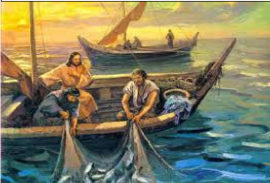
JESUS CALLS HIS FIRST DISCIPLES

AFTER JOHN HAD BEEN ARRESTED, JESUS WENT INTO GALILEE. THERE HE PROCLAIMED THE GOOD NEWS FROM GOD. 'THE TIME HAS COME HE SAID' AND THE KINGDOM OF GOD IS CLOSE AT HAND. REPENT, AND BELIEVE THE GOOD NEWS.' AS HE WAS WALKING ALONG BY THE SEA OF GALILEE HE SAW SIMON AND HIS BROTHER ANDREW CASTING A NET IN THE LAKE—FOR THEY WERE FISHERMEN. AND JESUS SAID TO THEM 'FOLLOW ME AND I WILL MAKE YOU INTO FISHERS OF MEN.' AND AT ONCE THEY LEFT THEIR NETS AND FOLLOWED HIM. GOING ON A LITTLE FURTHER, HE SAW JAMES SON OF ZEBEDEE AND HIS BROTHER JOHN; THEY TOO WERE IN THEIR BOAT, MENDING THEIR NETS. HE CALLED THEM AT ONCE AND, LEAVING THEIR FATHER ZEBEDEE IN THE BOAT WITH THE MEN HE EMPLOYED, THEY WENT AFTER HIM.