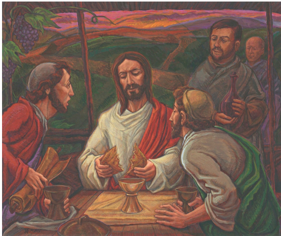
They recognised him in the "Breaking of the Bread"

WHEN THIS PERISHABLE NATURE HAS PUT ON IMPERISHABILITY, AND WHEN THIS MORTAL NATURE HAS PUT ON IMMORTALITY, THEN THE WORDS OF SCRIPTURE WILL COME TRUE: DEATH IS SWALLOWED UP IN VICTORY. DEATH, WHERE IS YOUR VICTORY? DEATH, WHERE IS YOUR STING? NOW THE STING OF DEATH IS SIN, AND SIN GETS ITS POWER FROM THE LAW. SO LET US THANK GOD FOR GIVING US THE VICTORY THROUGH OUR LORD JESUS CHRIST. NEVER GIVE IN THEN, MY DEAR BROTHERS, NEVER ADMIT DEFEAT; KEEP ON WORKING AT THE LORD'S WORK ALWAYS, KNOWING THAT, IN THE LORD, YOU CANNOT BE LABOURING IN VAIN.