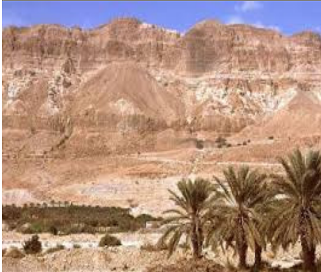
WILDERNESS OF JUDEA

JESUS WAS LED BY THE SPIRIT OUT INTO THE WILDERNESS TO BE TEMPTED BY THE DEVIL. HE FASTED FOR FORTY DAYS AND FORTY NIGHTS, AFTER WHICH HE WAS VERY HUNGRY, AND THE TEMPTER CAME AND SAID TO HIM, 'IF YOU ARE THE SON OF GOD, TELL THESE STONES TO TURN INTO LOAVES.' BUT HE REPLIED, 'SCRIPTURE SAYS: MAN DOES NOT LIVE ON BREAD ALONE BUT ON EVERY WORD THAT COMES FROM THE MOUTH OF GOD. THE DEVIL THEN TOOK HIM TO THE HOLY CITY AND MADE HIM STAND ON THE PARAPET OF THE TEMPLE 'IF YOU ARE THE SON OF GOD' HE SAID, 'THROW YOURSELF DOWN; FOR SCRIPTURE SAYS: HE WILL PUT HIM IN HIS ANGELS' CHARGE, AND THEY WILL SUPPORT YOU ON THEIR HANDS IN CASE YOU HURT YOUR FOOT AGAINST A STONE.' JESUS SAID TO HIM, 'SCRIPTURE ALSO SAYS: YOU MUST NOT PUT THE LORD YOUR GOD TO THE TEST.' NEXT, TAKING HIM TO A VERY HIGH MOUNTAIN, THE DEVIL SHOWED HIM ALL THE KINGDOMS OF THE WORLD AND THEIR SPLENDOUR. 'I WILL GIVE YOU ALL THESE' HE SAID, IF YOU FALL AT MY FEET AND WORSHIP ME.' THEN JESUS REPLIED, 'BE OFF, SATAN! FOR SCRIPTURE SAYS: YOU MUST WORSHIP THE LORD YOUR GOD, AND SERVE HIM ALONE.' THEN THE DEVIL LEFT HIM, AND ANGELS APPEARED AND LOOKED AFTER HIM. Matthew