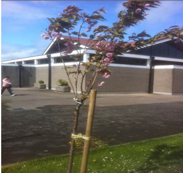
DIDN'T YOU REALISE THAT YOU WERE GOD'S TEMPLE AND THAT THE SPIRIT OF GOD WAS LIVING AMONG YOU

JESUS SAID TO HIS DISCIPLES: 'YOU HAVE LEARNT HOW IT WAS SAID: EYE FOR EYE AND TOOTH FOR TOOTH. BUT I SAY THIS TO YOU: OFFER THE WICKED MAN NO RESISTANCE. ON THE CONTRARY, IF ANYONE HITS YOU ON THE RIGHT CHEEK, OFFER HIM THE OTHER AS WELL; IF A MAN TAKES YOU TO LAW AND WOULD HAVE YOUR TUNIC, LET HIM HAVE YOUR CLOAK AS WELL. AND IF ANYONE ORDERS YOU TO GO ONE MILE, GO TWO MILES WITH HIM. GIVE TO ANYONE WHO ASKS, AND IF ANYONE WANTS TO BORROW, DO NOT TURN AWAY. 'YOU HAVE LEARNT HOW IT WAS SAID: YOU MUST LOVE YOUR NEIGHBOUR AND HATE YOUR ENEMY. BUT I SAY THIS TO YOU: LOVE YOUR ENEMIES AND PRAY FOR THOSE WHO PERSECUTE YOU; IN THIS WAY YOU WILL BE SONS OF YOUR FATHER IN HEAVEN, FOR HE CAUSES HIS SUN TO RISE ON BAD MEN AS WELL AS GOOD, AND HIS RAIN TO FALL ON HONEST AND DISHONEST MEN ALIKE. FOR IF YOU LOVE THOSE WHO LOVE YOU WHAT RIGHT HAVE YOU TO CLAIM ANY CREDIT? EVEN THE TAX COLLECTORS DO AS MUCH, DO THEY NOT? AND IF YOU SAVE YOUR GREETINGS FOR YOUR BROTHERS, ARE YOU DOING ANYTHING EXCEPTIONAL? EVEN THE PAGANS DO AS MUCH, DO THEY NOT? YOU MUST THEREFORE BE PERFECT JUST AS YOUR HEAVENLY FATHER IS PERFECT. Matthew