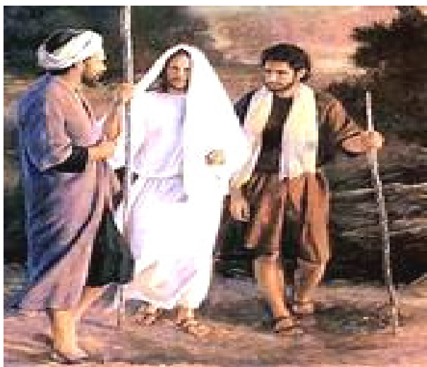
THEY RECOGNISED HIM IN THE BREAKING OF BREAD

.....AND AS THEY WERE EATING HE TOOK SOME BREAD, AND WHEN HE HAD SAID THE BLESSING HE BROKE IT AND GAVE IT TO THEM. 'TAKE IT, 'HE SAID 'THIS IS MY BODY.' THEN HE TOOK A CUP, AND WHEN HE HAD RETURNED THANKS HE GAVE IT TO THEM, AND ALL DRANK FROM IT, AND HE SAID TO THEM, 'THIS IS MY BLOOD, THE BLOOD OF THE COVENANT, WHICH IS TO BE Poured OUT FOR MANY. I TELL YOU SOLEMNLY, I SHALL NOT DRINK ANY MORE WINE UNTIL THE DAY I DRINK THE NEW WINE IN THE KINGDOM OF GOD.'