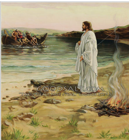
Jesus helped the disciples catch fish.. Not only did he cook the fish, but he served it to them as well.

JESUS REPLIED, THE CHILDREN OF THIS WORLD TAKE WIVES AND HUSBANDS BUT THOSE WHO ARE JUDGED WORTHY OF A PLACE IN THE OTHER WORLD AND IN THE RESURRECTION FROM THE DEAD DO NOT MARRY BECAUSE THEY CAN NO LONGER DIE, FOR THEY ARE THE SAME AS THE ANGELS, AND BEING CHILDREN OF THE RESURRECTION THEY ARE SONS OF GOD. AND MOSES HIMSELF IMPLIES THAT THE DEAD RISE AGAIN, IN THE PASSAGE ABOUT THE BUSH WHERE HE CALLS THE LORD THE GOD OF ABRAHAM, THE GOD OF ISAAC AND THE GOD OF JACOB. NOW HE IS GOD, NOT OF THE DEAD, BUT OF THE LIVING; FOR TO HIM ALL MEN ARE IN FACT ALIVE.' Luke