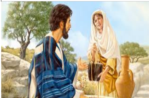
Jesus said to her 'Give me a drink'

JESUS CAME TO THE SAMARITAN TOWN CALLED SYCHAR, NEAR THE LAND THAT JACOB GAVE TO HIS SON JOSEPH. JACOB'S WELL IS THERE AND JESUS, TIRED BY THE JOURNEY, SAT STRAIGHT DOWN BY THE WELL. IT WAS ABOUT THE SIXTH HOUR. WHEN A SAMARITAN WOMAN CAME TO DRAW WATER, JESUS SAID TO HER 'GIVE ME A DRINK'. HIS DISCIPLES HAD GONE INTO TOWN TO BUY FOOD. THE SAMARITAN WOMAN SAID TO HIM, 'WHAT? YOU ARE A JEW AND YOU ASK ME, A SAMARITAN, FOR A DRINK?' - JEWS, IN FACT, DO NOT ASSOCIATE WITH SAMARITANS. JESUS REPLIED: 'IF YOU ONLY KNEW WHAT GOD IS OFFERING AND WHO IT IS THAT IS SAYING TO YOU: GIVE ME A DRINK, YOU WOULD HAVE BEEN THE ONE TO ASK, AND HE WOULD HAVE GIVEN YOU LIVING WATER.' YOU HAVE NO BUCKET, SIR' SHE ANSWERED ' AND THE WELL IS DEEP: HOW COULD YOU GET THIS LIVING WATER?' JESUS REPLIED: 'WHOEVER DRINKS THIS WATER WILL GET THIRSTAGAIN: BUT ANYONE WHO DRINKS THE WATER THAT I SHALL GIVE WILL NEVER BE THIRSTY AGAIN: THE WATER THAT I SHALL GIVE WILL TURN INTO A SPRING INSIDE HIM, WELLING UP TO ETERNAL LIFE.'