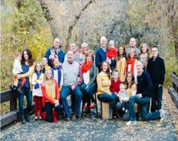
WORLD MEETING OF FAMILIES 21ST/26TH AUGUST 2018

WHEN THE PHARISEES HEARD THAT JESUS HAD SILENCED THE SADDUCEES THEY GOT TOGETHER AND, TO DISCONCERT HIM ONE OF THEM PUT A QUESTION, 'MASTER, WHICH IS THE GREATEST COMMANDMENT OF THE LAW? JESUS SAID, 'YOU MUST LOVE THE LORD YOUR GOD WITH ALL YOUR HEART, WITH ALL YOUR SOUL AND WITH ALL YOUR MIND. THIS IS THE GREATEST AND THE FIRST COMMANDMENT. THE SECOND RESEMBLES IT: YOU MUST LOVE YOUR NEIGHBOUR AS YOURSELF. ON THESE TWO COMMANDMENTS HANG THE WHOLE LAW, AND THE PROPHETS ALSO.