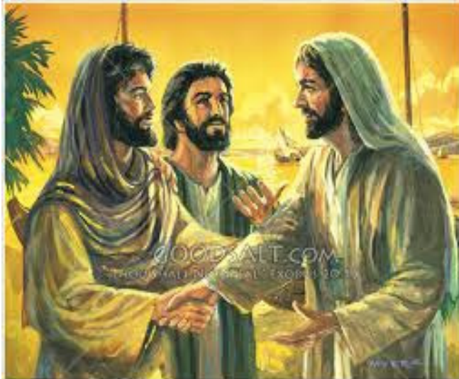
ANDREW MET HIS BROTHER AND SAID TO HIM, 'WE HAVE FOUND THE MESSIAH' - WHICH MEANS THE CHRIST—AND HE TOOK SIMON TO JESUS

AS JOHN STOOD WITH TWO OF HIS DISCIPLES, JESUS PASSED AND JOHN STARED HARD AT HIM AND SAID, 'LOOK, THERE IS THE LAMB OF GOD.' HEARING THIS, THE TWO DISCIPLES FOLLOWED JESUS. JESUS TURNED ROUND, SAW THEM FOLLOWING AND SAID, 'WHAT DO YOU WANT?' THEY ANSWERED, 'RABBI,' - WHICH MEANS TEACHER- 'WHERE DO YOU LIVE?' 'COME AND SEE' HE REPLIED; SO THEY WENT AND SAW WHERE HE LIVED, AND STAYED WITH HIM THE REST OF THAT DAY. IT WAS ABOUT THE TENTH HOUR. ONE OF THESE TWO WHO BECAME FOLLOWERS OF JESUS AFTER HEARING WHAT JOHN HAD SAID WAS ANDREW, THE BROTHER OF SIMON PETER. EARLY NEXT MORNING, ANDREW MET HIS BROTHER AND SAID TO HIM, 'WE HAVE FOUND THE MESSIAH' - WHICH MEANS THE CHRIST—AND HE TOOK SIMON TO JESUS. JESUS LOOKED HARD AT HIM AND SAID, 'YOU ARE SIMON, SON OF JOHN; YOU ARE TO BE CALLED CEPHAS' - MEANING ROCK.