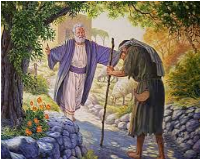
SO HE LEFT THE PLACE AND WENT BACK TO HIS FATHER

FOR ANYONE WHO IS IN CHRIST, THERE IS A NEW CREATION; THE OLD CREATION HAS GONE, AND NOW THE NEW ONE IS HERE. IT IS ALL GOD'S WORK. IT WAS GOD WHO RECONCILED US TO HIMSELF THROUGH CHRIST AND GAVE US THE WORK OF HANDING ON THIS RECONCILIATION. IN OTHER WORDS, GOD IN CHRIST WAS RECONCILING THE WORLD TO HIMSELF, NOT HOLDING MEN'S FAULTS AGAINST THEM, AND HE HAS ENTRUSTED TO US THE NEWS THAT THEY ARE RECONCILED. SO WE ARE AMBASSADORS FOR CHRIST; IT IS AS THOUGH GOD WERE APPEALING THROUGH US, AND THE APPEAL THAT WE MAKE IN CHRIST'S NAME IS : BE RECONCILED TO GOD. FOR OUR SAKE GOD MADE THE SINLESS ONE INTO SIN, SO THAT IN HIM WE MIGHT BECOME THE GOODNESS OF GOD.