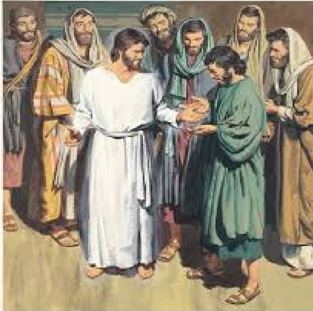
THE DISCIPLES WERE FILLED WITH JOY WHEN THEY SAW THE LORD

..... THOMAS, CALLED THE TWIN, WHO WAS ONE OF THE TWELVE, WAS NOT WITH THEM WHEN JESUS CAME. WHEN THE DISCIPLES SAID, 'WE HAVE SEEN THE LORD' HE ANSWERED, 'UNLESS I SEE THE HOLES THAT THE NAILS MADE IN HIS HANDS AND CAN PUT MY FINGER INTO THE HOLES THEY MADE, AND UNLESS I CAN PUT MY HAND INTO HIS SIDE, I REFUSE TO BELIEVE.' EIGHT DAYS LATER THE DISCIPLES WERE IN THE HOUSE AGAIN AND THOMAS WAS WITH THEM. THE DOORS WERE CLOSED, BUT JESUS CAME IN AND STOOD AMONG THEM. 'PEACE BE WITH YOU' HE SAID. THEN HE SPOKE TO THOMAS, 'PUT YOUR FINGER HERE; LOOK, HERE ARE MY HANDS. GIVE ME YOUR HAND; PUT IT INTO MY SIDE. DOUBT NO LONGER BUT BELIEVE. JOHN