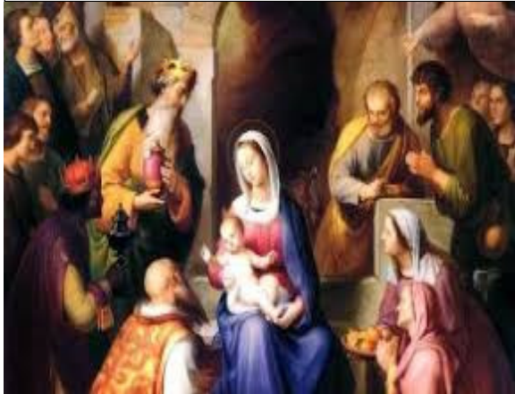
FALLING TO THEIR KNEES THEY DID HIM HOMAGE

AFTER JESUS HAD BEEN BORN AT BETHLEHEM IN JUDAEA DURING THE REIGN OF KING HEROD, SOME WISE MEN CAME TO JERUSALEM FROM THE EAST. 'WHERE IS THE INFANT KING OF THE JEWS?' THEY ASKED. 'WE SAW HIS STAR AS IT ROSE AND HAVE COME TO DO HIM HOMAGE.' WHEN KING HEROD HEARD THIS HE WAS PERTURBED, AND SO WAS THE WHOLE OF JERUSALEM. HE CALLED TOGETHER ALL THE CHIEF PRIESTS AND THE SCRIBES OF THE PEOPLE AND ENQUIRED OF THEM WHERE THE CHRIST WAS TO BE BORN. 'AT BETHLEHEM IN JUDAEA,' THEY TOLD HIM, 'FOR THIS IS WHAT THE PROPHET WROTE: AND YOU BETHLEHEM, IN THE LAND OF JUDAH, YOU ARE BY NO MEANS LEAST AMONG THE LEADERS OF JUDAH, FOR OUT OF YOU WILL COME A LEADER WHO WILL SHEPHERD MY PEOPLE ISRAEL.....AND THERE IN FRONT OF THEM WAS THE STAR THEY HAD SEEN RISING; IT WENT FORWARD AND HALTED OVER THE PLACE WHERE THE CHILD WAS. THE SIGHT OF THE STAR FILLED THEM WITH DELIGHT, AND GOING INTO THE HOUSE THEY SAW THE CHILD WITH HIS MOTHER MARY, AND FALLING TO THEIR KNEES THEY DID HIM HOMAGE. THEN, OPENING THEIR TREASURERS, THEY OFFERED HIM GIFTS OF GOLD AND FRINCENSE AND MYRRH. BUT THEY WERE WARNED IN A DREAM NOT TO GO BACK TO HEROD, AND RETURNED TO THEIR OWN COUNTRY BY A DIFFERENT WAY. Matthew