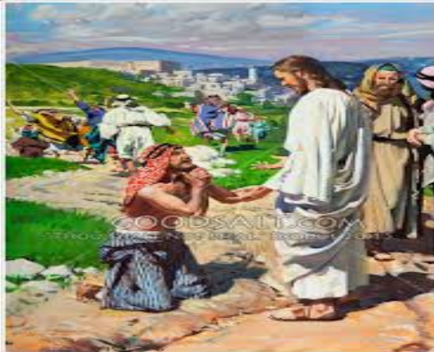
JESUS HEALS THE LEPER

SUNDAY 13TH OCTOBER, 2019 TWENTY-EIGHT SUNDAY IN ORDINARY TIME VOLUME 34. NO. 7.