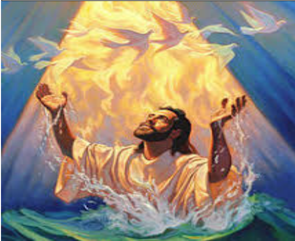
JOHN DECLARED I SAW THE SPIRIT COMING DOWN ON HIM FROM HEAVEN AND RESTING ON HIM. JESUS WILL BAPTISE WITH THE HOLY SPIRIT

SEEING JESUS COMING TOWARDS HIM, JOHN SAID 'LOOK, THERE IS THE LAMB OF GOD THAT TAKES AWAY THE SIN OF THE WORLD. THIS IS THE ONE I SPOKE OF WHEN I SAID: A MAN IS COMING AFTER ME WHO RANKS BEFORE ME BECAUSE HE EXISTED BEFORE ME. I DID NOT KNOW HIM MYSELF, AND YET IT WAS TO REVEAL HIM TO ISRAEL THAT I CAME BAPTISING WITH WATER.' JOHN ALSO DECLARED, 'I SAW THE SPIRIT COMING DOWN ON HIM FROM HEAVEN LIKE A DOVE AND RESTING ON HIM. I DID NOT KNOW HIM MYSELF BUT HE WHO SENT ME TO BAPTISE WITH WATER HAD SAID TO ME. "THE MAN ON WHOM YOU SEE THE SPIRIT COME DOWN AND REST IS THE ONE WHO IS GOING TO BAPTISE WITH THE HOLY SPIRIT." YES, I HAVE SEEN AND I AM THE WITNESS THAT HE IS THE CHOSEN ONE OF GOD.