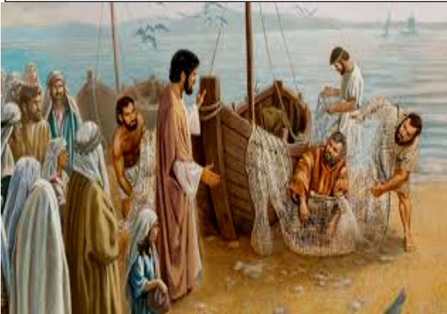
JESUS CALLS HIS APOSTLES TO FOLLOW HIM AND PROCLAIM THE GOSPEL

BAPTISM CALLED AND SENT THROUGH OUR BAPTISM LIKE THE APOSTLES CALLED TO FOLLOW HIM AND PROCLAIM THE GOSPEL, WE ARE CALLED BY JESUS TO FOLLOW HIM AND SENT TO SUPPORT ONE ANOTHER IN FAITH AND HOPE AND LOVE. WE ARE BAPTIZED WITH WATER. IN BAPTISM WE ARE BAPTIZED IN THE NAME OF THE FATHER, AND OF THE SON, AND OF THE HOLY SPIRIT. WE ARE ANOINTED WITH THE OIL OF BAPTISM. "WE ANOINT YOU WITH THE OIL OF SALVATION IN THE NAME OF CHRIST OUR SAVIOUR; MAY HE STRENGTHEN YOU WITH HIS POWER, WHO LIVES AND REIGNS FOR EVER AND EVER" WE ARE ANOINTED WITH THE OIL OF CHRISM; "GOD THE FATHER OF OUR LORD JESUS CHRIST HAS FREED YOU FROM SIN, GIVEN YOU A NEW BIRTH BY WATER AND THE HOLY SPIRIT, AND WELCOMED YOU INTO HIS HOLY SPIRIT. HE NOW ANOINTS YOU WITH THE CHRISM OF SALVATION. AS CHRIST WAS ANOINTED AS PRIEST, PROPHET AND KING, SO MAY YOU LIVE ALWAYS AS A MEMBER OF HIS BODY, SHARING EVERLASTING LIFE. "THE LORD MADE THE DEAF HEAR AND THE DUMB SPEAK. MAY HE TOUCH YOUR EARS TO RECEIVE HIS WORD, AND THE MOUTH TO PROCLAIM HIS FAITH TO THE PRAISE AND GLORY OF GOD THE FATHER.